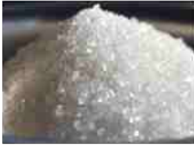
World Class Sugar