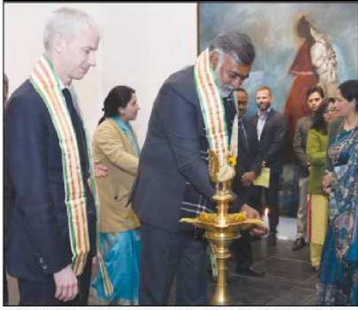
The Minister of State for Culture and Tourism (Independent Charge), Shri Prahlad Singh Patel lighting the lamp to inaugurate the exhibition of French painter Gerard Garouste, in New Delhi on January 28, 2020. The Culture Minister of France, Mr. Franck Riester is also seen.

MM BUREAU New Delhi/January 29 Such has been the improvement in the standard of education in Delhi government schools that as many as 61 per cent respondents said they would prefer sending their children to a government school over a private one, according to the Neta App Janata Barometer Survey conducted just before the February 8 Assembly elections.