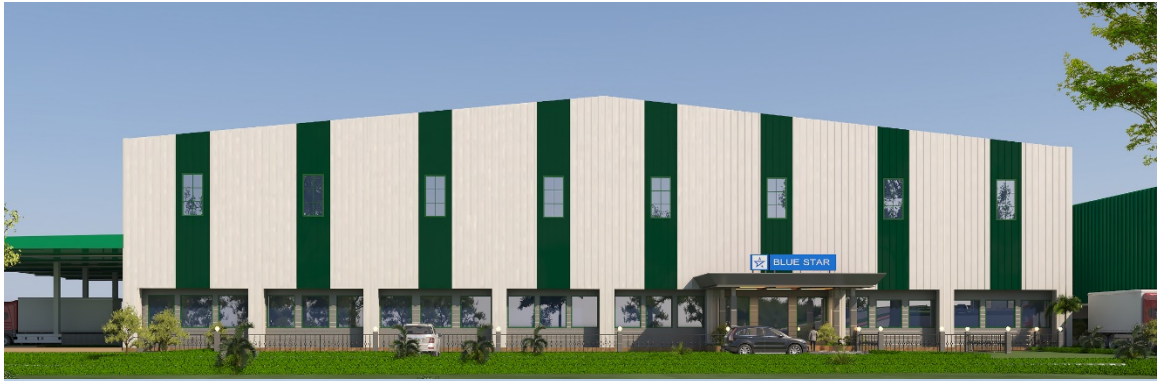
A glimpse of the frontal view of Blue Star's new world-class manufacturing facility at Wada