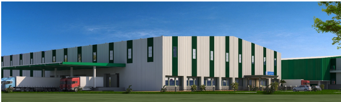
A glimpse of the side view of Blue Star's new world-class manufacturing facility at Wada