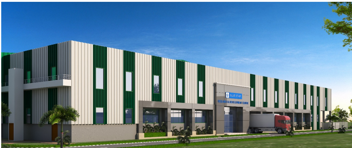
A glimpse of the R&D facility at Blue Star's new world-class manufacturing plant at Wada