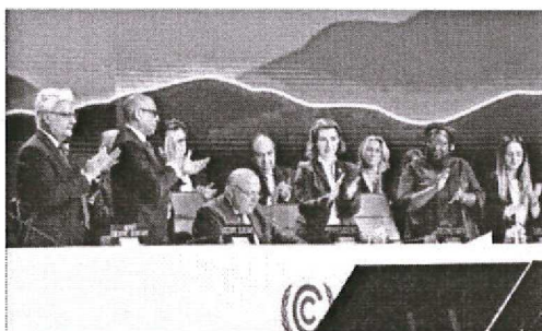
Delegates applaud as COP27 President Sameh Shoukry delivers a statement during the closing plenary of the climate summit at Sharm el-Sheikh in Egypt

JAPAN'S INTERNAL AFFAIRS minister Minoru Terada resigned on Sunday in connection with a funding scandal, becoming the third cabinet member to leave in less than a month. PM Fumio Kishida's Kishida's approval ratings have sunk after the assassination of former PM Shinzo Abe revealed deep and long-standing ties between ruling Liberal Democratic Party politicians and the Unification Church.