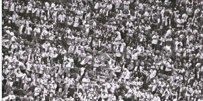
Ecuador fans inside a Qatar stadium before the FIFA World Cup's inaugural match on Sunday.

The billionaire has since sought to reassure users and planned to reverse the ban on Trump, and the timing of any return by Trump was closely watched — and feared — by many of Twitter's advertisers.