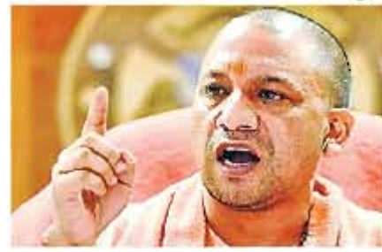
किसान परिवार में जन्म लेने वाले और भात पाता के प्रति पूर्ण श्रद्धा-आस्था के कारण गणराज्य को रूपरेखा स्वतंत्र भारत के अन्दर गणराज्य की एकता और अखंडता के लिए समर्पित किया। देश के स्वतंत्र होने के समय मौके पर मुख्यमंत्री ने कहा कि एक सामान्य

राज्यपाल आनंदीबेन पटेल और मुख्यमंत्री योगी आदित्यनाथ ने लौह पुरुष सरदार वल्लभ भाई पटेल की जयंती पर शनिवार को यहां हजतगंज स्थित उनकी प्रतिमा पर पुष्पांजलि व माल्यार्पण कर अपनी श्रद्धांजलि दी।