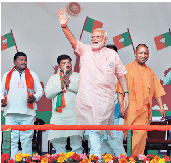
Prime Minister Narendra Modi at a rally in Amroha.

When he heard the crowd's response, Modi said: "You understood automatically. The family cannot tolerate the stern attitude of the chowkidar (watchman)." The ED had filed a supplementary charge sheet against Michel in a Delhi court