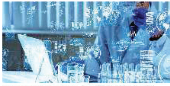
EXPOSING VIOLATIONS. From 2014 to 2015, the FDA conducted a pilot programme in India that eliminated extended advance notice for inspections

From 2014 to 2015, the FDA conducted a pilot programme in India that eliminated extended advance notice for inspections. "The pilot programme appears to