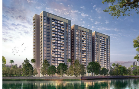
Newyork by Manjeera, Bangalore