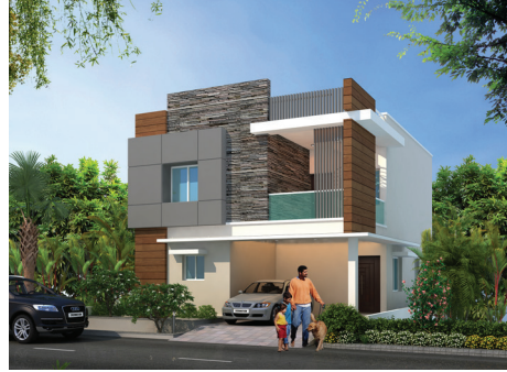
Manjeera Blue, Ongole