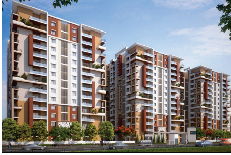
Vasavi Lake City, Hafeezpet