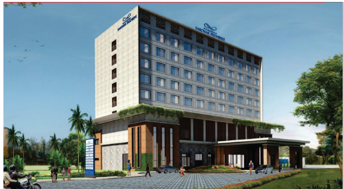
Manjeera Sarovar Premier Hotel