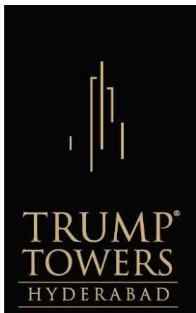
Trump Towers, Hyderabad