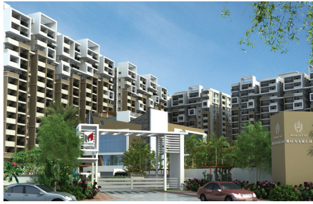
Manjeera Monarch, Vijayawada