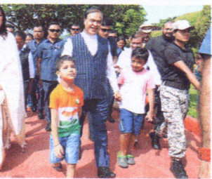
The Assam CM with his wife visited Shradhrajyoti Kanar at Gowahati on August 15.

consists of the eight States of Arunachal Pradesh, Assam, Manipur, Meghalaya, Mizoram, Nagaland, Sikkim and Tripura. The North Eastern Council was constituted in 1971 by an Act of Parliament. NEC has been instrumental in setting in motion a new economic endeavour aimed at removing the basic handicaps that stood in the way of normal development of the region and has ushered in an era of new hope in this backward area full of great potentials. The main objective of the Council is to ensure the balanced and integrated economic development of the North Eastern part of the country. Financial Adviser and T&C Adviser also delivered lectures on the occasion.