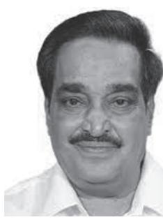
Gujarat BJP president CR Paatil

AHMEDABAD, JUNE 22 /-- Gujarat BJP president C R Paatil today said there is "political grudge and grievance" behind the PIL filed by Congress leader Paresh Dhanani in the Gujarat High Court over the distribution of Remdesivir injections from the BJP office in Surat when COVID-19 cases had peaked in April.