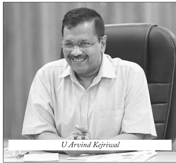
U Arvind Kejriwal

Na kajinglah ban trei ha kaba iadei bad ka koit ka khaiah, ka pule puthi, ka ielektrik, ka umbam umdih bad mynta ka jinglah ban tehlakam ia u khyang jingpang, ki brierw ki iohi ba ki don jingkyrmen ha ka seng AAP bad ki la kwah ia ka ba kan nang kiew ha kaba iadei bad ki jingpyntreikam. U Myntri Rangbah u la ong ba kane ka seng AAP ka dei kaba dang mynta shibit bad ka la shim por ia ka ba kan pyniar ia ka seng sha baroh kawe ki ri. U la ong ba ka seng ka la lah ban thaw sorkar da lai sien ha Delhi. U la iathuh ba u la kwah ban nang pynsuhtied shuh shuh ia ka jingsynshar sha kiwei pat ki jylla bad ki bynta jong ka ri ha kaba mynta u la rai ban iakhun na baroh ki konstitwensi ha ka ilekshon ha