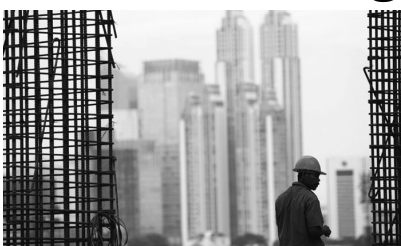
The relief is important as in Q1, the aggregate net sales of the top 1,670 firms fell sharply by 25.3%, while the net profits declined almost 60% YoY

The relief is important for India Inc as in the first quarter of fiscal 2021, the aggregate net sales of the top 1,670 companies fell sharply by 25.3 per cent while the net profits declined by almost 60 per cent (YoY). Of this, nearly 35 per cent of the