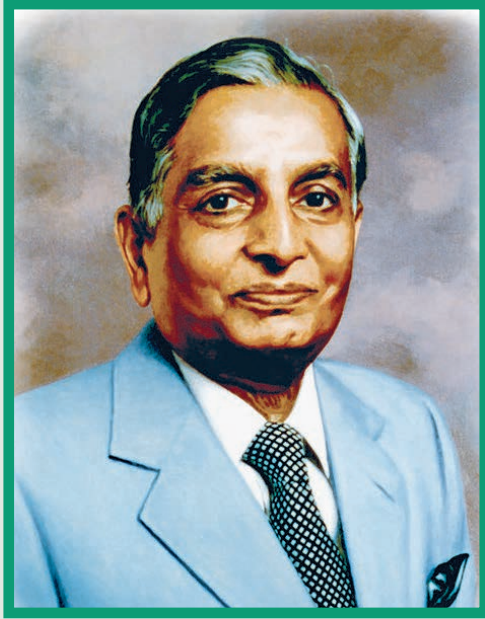
Syt. Madhav Prasadji Birla (1918-1990)