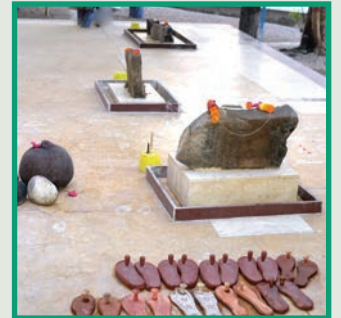
TEMPLES IN THE COMPANY'S TOWNSHIP AT REWA, MADHYA PRADESH