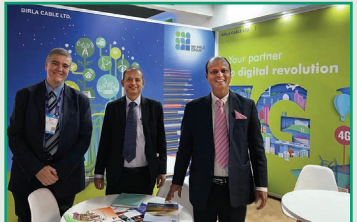
Birla Cable participated in Mobile World Congress 2023 held in Barcelona, Spain.