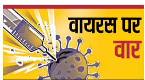
वायरस पर वार