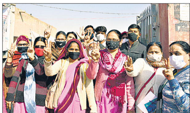
राजस्थान के बीकानेर में गुरुवार को टीका लगवाने के बाद आशा कार्यकर्ता।