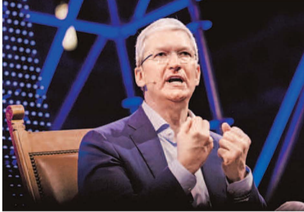
Last quarter was the first full quarter of the online store, and that received great reaction, said Apple CEO Tim Cook.

Driven by older iPhone models such as the iPhone SE 2020, iPhone 11 and iPhone XR, Apple's India business almost doubled during the December quarter, said industry analysts. "There are certain markets where our share is quite low. India is one of them. It did improve from the year-ago quarter. Our business roughly doubled. So, we feel pretty good about the trajectory," Apple chief executive Tim Cook said in an earnings call on Wednesday night.