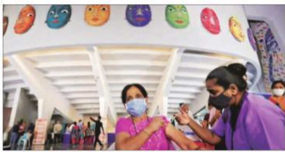
A woman receives a dose of COVID-19 vaccine at an auditorium in Ahmedabad on Friday.

The Gavi alliance said in a statement that the COVAX vaccine-sharing facility had notified