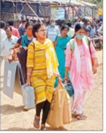
মহিলা ভোটাররা ভোটে গিয়েছেন ভোটে গিয়ে।

পুরুলিয়ায় ১৪৪টি বুথ পরিচালনা করবেন মহিলারা।