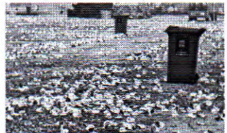
Students from Classes 2nd to 10th would participate in the activity formed about the ill-effects of plastic, said an official. The initiative collaborates with the Heart Foundation, a charitable organization working in the field of education.

"We expect more than 50,000 school children to participate in this initiative to promote and disseminate the ban on plastics. Through this, the children will be in-