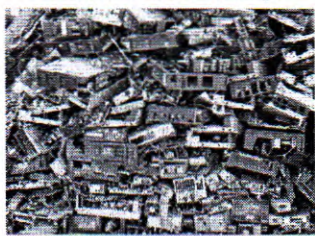
The collected e-waste will now be recycled by Ecoore Ltd company as per the stipulated guidelines

Dustbins were placed by the civic body in several residential buildings