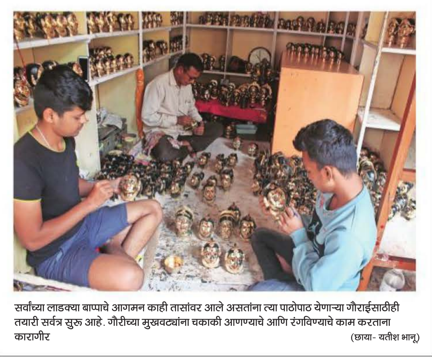
सर्वांच्या लाडक्या बाप्पाचे आगमन काही तासांवर आले असताना त्या पाठोपाठ येणाऱ्या गौराईसाठीही तयारी सर्वत्र सुरु आहे. गौरीच्या मुखवट्यांना चकाकी आणण्याचे आणि रंगविण्याचे काम करताना कारागीर