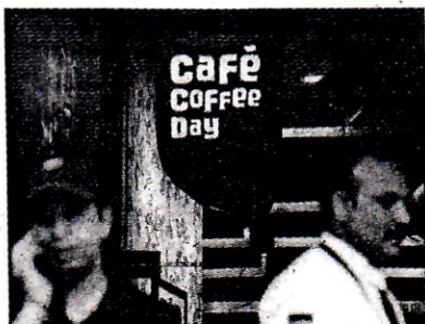
Coffee Day Group has not received any funding support from banks in the last five months

(to its credi- on added. cided to sell ck to private d realty firm ₹2,700 crore. the develop- working capi- and vending nally without me of its sub-