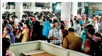
Ahmedabad: Even as the city grapples with dengue cases and the fear of Covid-19 third wave, swine flu cases have started surfacing. One person has also lost his life due to the viral flu. Public health officials in the city were much relieved when hardly any swine flu