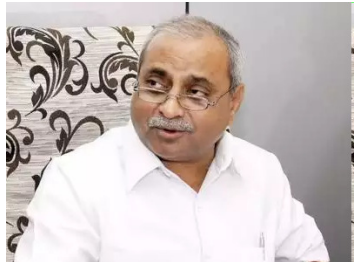
AHMEDABAD: Gujarat deputy chief minister Nitin Patel on Thursday said there was no substance in the claims that around 15 agricultural

produce market committees (APMCs) have been shut in the state due to negligible business. Patel said that almost all the APMC, except 20 to 22, in the state were financially sound and working properly. A media report has claimed that there was virtually no business activity in approximately 15 APMCs, while around 115 others were on the verge of closure, which has put a question mark on the future of around 3,000 employees. Patel said he held a meeting with state Agriculture Minister R C Faldu and Cooperation Minister Ishwarsinh Patel on Wednesday to review the present financial situation and turnover of over 200 APMCs registered in Gujarat. "There is no substance in the reports, which claim that some APMCs have been shut. All are functioning as of today. In the review meeting, we found that almost all the APMCs are financially sound and working properly," he told reporters in Viramgam town near here after laying the foundation stone for a new APMC. "Only 20 to 22 APMCs, which were established several years back, are facing some issues today because the management did not bother to create new infrastructure or facilities for farmers and traders all these years. Auctions of agri produce are also not happening there. Even traders were not allotted shops in the premises," the deputy CM said. Patel added that such