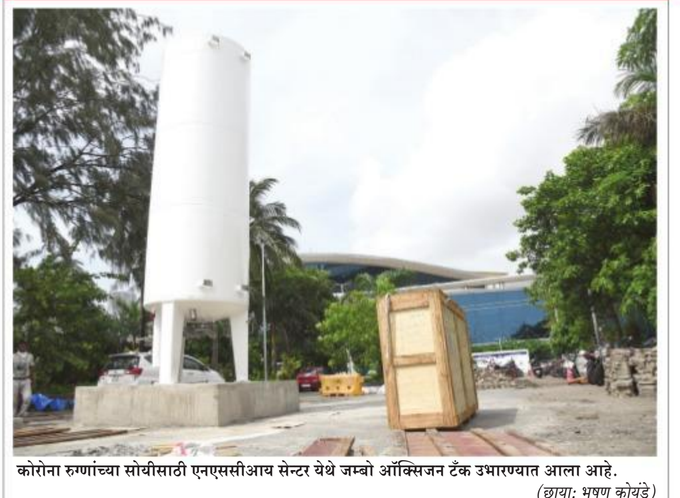
कोरोना रुग्णांच्या सोयीसाठी एनएससीआय सेंटर येथे जन्मो ऑक्सिजन टँक उभारण्यात आला आहे.

दुपारी व रात्री जेवण यासह दूध आदी पोषक आहार पुरवला जातो आहे. तसेच रुग्णांची गरज लक्षात घेऊन औषधाचा पुरेसा साठाही उपलब्ध आहे. रुग्णसेवेसाठी ३ सत्रांमध्ये १० डॉक्टरसह, १५ नर्स आणि तत्सम इतर कामे करण्यासाठी ७० वॉर्डबॉय नेमण्यात आले आहेत. तसेच मदतीसाठी ७० कर्मचारी नेमण्यात आले आहेत. रुग्णांना ऑक्सिजनचा पुरवठा योग्यरित्या व सुरळीत होण्यासाठी पुरेसे सिलेंडर्स उपलब्ध असून त्याबाबत आवश्यक ती सर्व खबरदारी घेण्यात आली आहे. तसेच या केंद्रासाठी स्वतंत्र व २४ तास उपलब्ध असणारी रुग्णावाहिकाही तैनात आहे.