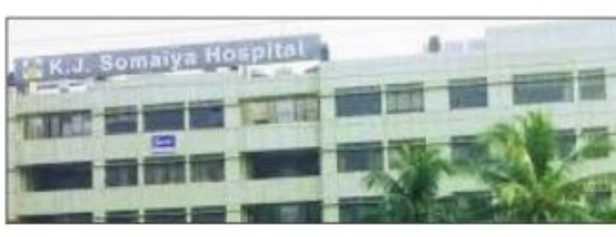
The state charity commissioner revealed the detail in an affidavit following a probe into an alleged incident of K J Somaiya Hospital charging Rs 12.5 lakh from some 'poor' patients for Covid treatment.

However, it is not clear whether these patients were infected by coronavirus. The state charity commissioner revealed this detail in an affidavit following a probe into an alleged incident of K J Somaiya Hospital charging Rs 12.5 lakh from some "poor" patients for COVID-19 treatment. However, the affidavit also