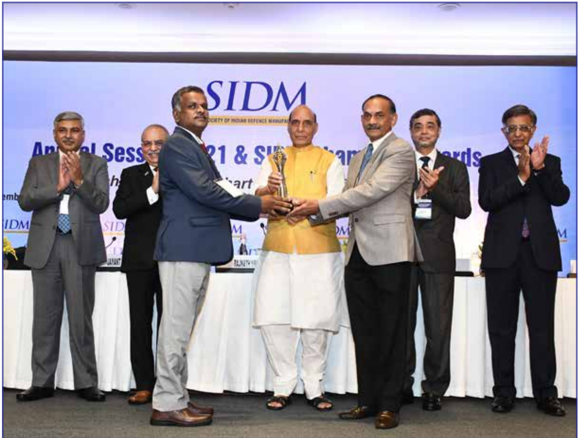
Champion Award - Import Substitution