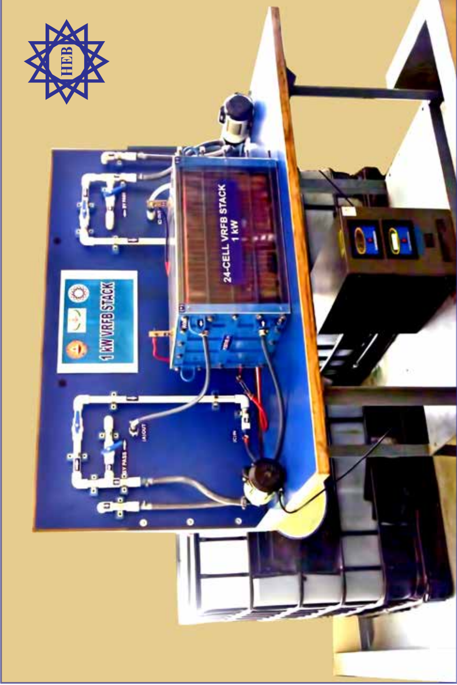
Flow Battery - Energy Storage System