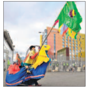
A protester outside the venue of COP26 in Glasgow.

Indian and global energy markets and give a sense of much needed long-term certainty to the investors in the energy domain. The enhanced ambition of 2030 targets make the net-zero announcement even more credible. The PM has stamped India's leadership in the climate discourse. Any ambitious target would have its share of challenges. The biggest near-term challenge is in electricity market design and distribution sector reforms. For the longer term, it would be managing the human resources in the coal sector. Skilled human resources for the new shape of energy markets would be critical. So, challenges galore, but strategic planning would help.