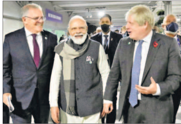
PM Narendra Modi with his British counterpart Boris Johnson and Australia's PM Scott Morrison in Glasgow on Tuesday.

Using the vision of One Sun One World One Grid through interconnected green grids can be transformational, enabling all of us to meet the targets of the Paris Agreement to prevent dangerous climate change...these efforts can stimulate green investments and create millions of good jobs. The declaration has been endorsed by 80 International Solar Alliance (ISA) member countries.