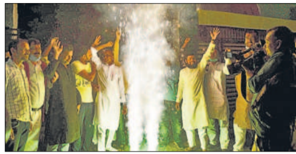
पटना में मंगलवार को उपचुनाव में मिली जीत के बाद जश्न मनाते जदयू कार्यकर्ता।

उपचुनावों को लेकर ज्यादा चौंकाने वाले नतीजे हिमाचल के हैं। वहां अगले वर्ष चुनाव होने हैं। विधानसभा की तीन और लोकसभा की एक सीट को कांग्रेस जीतने में सफल रही है। उसने लोकसभा व विधानसभा को एक-एक सीट भाजपा से छीनी है। जबकि राज्य में भाजपा की सरकार है। आमतौर पर जिस दल की सरकार राज्य में होती है, उसे ऐसी पराजय का सामना नहीं करना पड़ता है। इसलिए हिमाचल की हार-जीत को आगामी चुनावों से जोड़कर देखा जाने लगा है। पर चुनाव में अभी वक्त है और भाजपा के पास रणनीति को नए सिरे से निर्धारित करने का पर्याप्त वक्त है। राजस्थान में