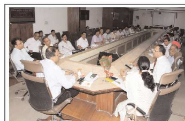
लघु सचिवालय के सभागार में जिला स्तरीय समीक्षा बैठक का हुआ आयोजन

वे मंगलवार को लघु सचिवालय के सभागार में बैंकर्स की जिला स्तरीय समीक्षा बैठक को संबोधित कर रहे थे। एसडीएम ने कहा कि सरकार द्वारा कृषि क्षेत्र तथा सूक्ष्म एवं लघु उद्योगों को गति प्रदान करने के उद्देश्य से अनेक योजनाएं चलाई गईं हैं। इन योजनाओं का लाभ पात्रों को डीबीटी के माध्यम से सीधा लाभ दिया जाना आवश्यक है। इस कार्य में बैंकर्स की भूमिका बेहद महत्वपूर्ण है। यही नहीं श्रमिकों के कल्याण, महिला सशक्तिकरण, युवाओं को स्वरोजगार