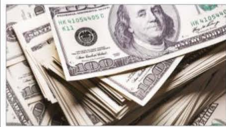
Emerging bonds have outperformed this year

risk to the EM inflation story, investors have largely looked through that threat.