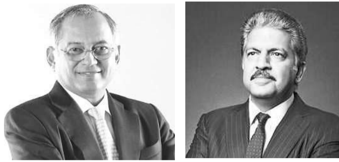
Members Venu Srinivasan (left) and Anand Mahindra