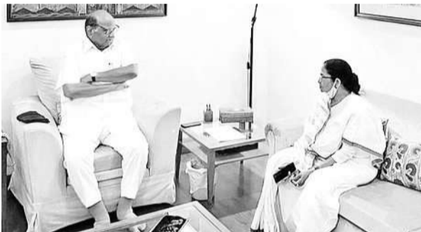
Trinamool Congress chief Mamata Banerjee called upon NCP chief Sharad Pawar at his residence in New Delhi

Interestingly, the information that Pawar has refused to be the joint Opposition candidate was conveyed to the public by CPI(M) General Secretary Sitaram Yechury. Pawar met Yechury, CPI gen-