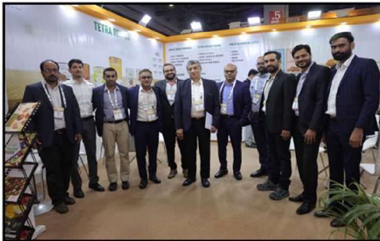
Foods And Inns Team