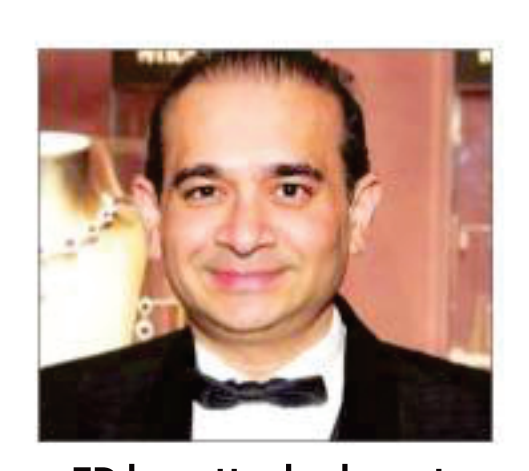
ED has attached assets worth ₹2,348 crore of Nirav Modi under the Prevention of Money Laundering Act till now

"The confiscated properties are in the form of four flats at the iconic building Samudra Mahal in Worli Mumbai, a seaside farm house and land in Al-