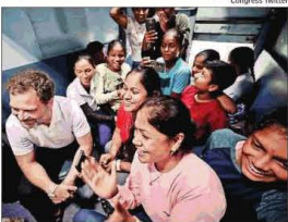
Congress leader Rahul Gandhi interacts with people while travelling by train from Bilaspur to Raipur on Monday