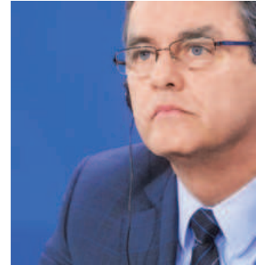
WTO director-general Roberto Azevedo.

pered as firms employ fewer workers to produce goods and services for export. Resolving trade disagreements would allow WTO members to avoid such costs," he added.