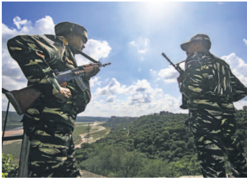
A three-judge bench adjourned to 16 October the hearing of petitions challenging the restrictions imposed because of the abrogation of provisions of Article 370.

A five-judge constitutional bench of the Supreme Court on Tuesday adjourned to 14 November the hearing of petitions challenging the abrogation of provisions of Article 370, which gave special status to Jammu and Kashmir. Meanwhile, a three-judge SC bench adjourned the hearing of petitions challenging the restrictions imposed following the Centre's move to 16 October. The five-judge bench, headed by Justice N.V. Ramana, and comprising Justices S.K. Kaul, R. Subhash Reddy, B.R. Gawai, and Surya Kant, heard several pleas challenging the Centre's 5 August decision to revoke J&K's special status, and bifurcate the state into the Union territories (UTs) of Jammu and Kashmir, and Ladakh. The UTs will come into being on 31 October.