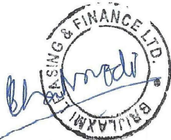
SIDDHARTH CHATURVEDI DIRECTOR

(**) Diluted share/voting capital means the total number of shares in the TC assuming full conversion of the outstanding convertible securities/warrants into equity shares of the TC.