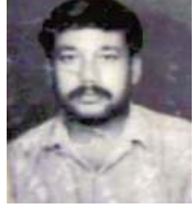
HC/GD S S ROY BIOM BACHELI 16 Nov-2011