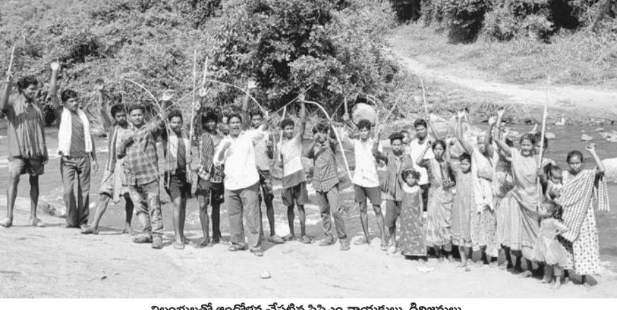
విల్లంబులలో ఆందోళన చేపట్టిన సిపిఎం నాయకులు, గిరిజనులు

గిరిజనులకు, ప్రజలకు నష్టం చేకూర్చే హైద్రో పవర్ ప్లాంట్ కు ప్రభుత్వం అనుమతులన్నీ ఊరుకునేదిలేదని సిపిఎం అసాపజ్జి జిల్లా కార్యదర్శి వ్యాఖ్య చేశారు.