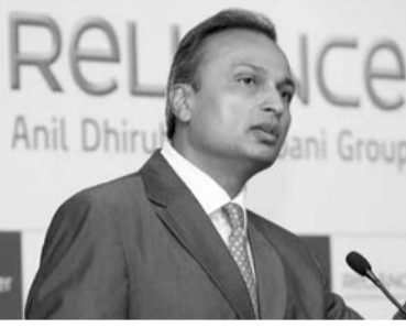
కంపెనీ ఎన్ఐఇసిబి నిర్ణయాన్ని ఎలాంటి బిడ్డింగ్లో పాల్గొనడం వల్ల రేకుండా చర్యలు చేపట్టింది. జూనియర్ 1 గిగావాట్ సోలార్ పవర్, 2 గిగావాట్

స్టాండ్లోని బ్యాంకు ఎన్ఐఐ సోలార్ సిస్టమ్ కోసం ఎన్ఐఇసిబి బిడ్డను ఆహ్వానించింది. ఇందులో రిలయన్స్ పవర్ ఆనుబంధ సంస్థ రిలయన్స్ ను జెన్ పార్ట్లోని బివర్ రిలయన్స్ బివర్ రిలయన్స్ నకీలి గ్యారంటీలు అందించినట్లు తమ దర్యాప్తులో తెలిపిన ఎన్ఐఇసిబి వెల్లడించింది.