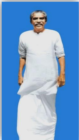
Shri, Baby John (1917 – 2008)