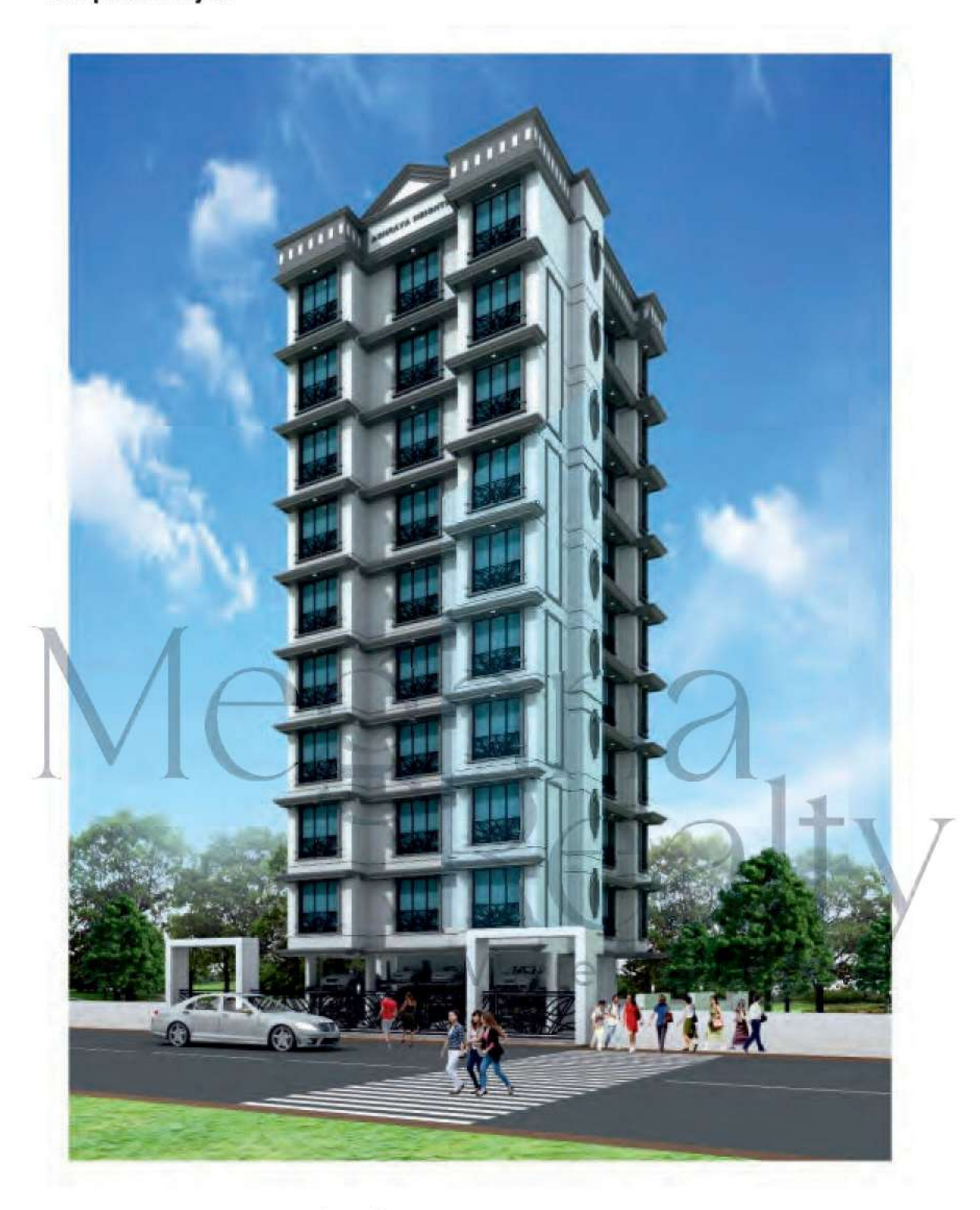
Ashraya Heights, Goregaon (West), Mumbai Completed 15 Months Before Time Possession