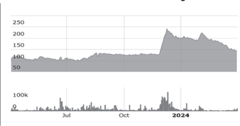
ON BSE: Share Price movement during 2023-24: