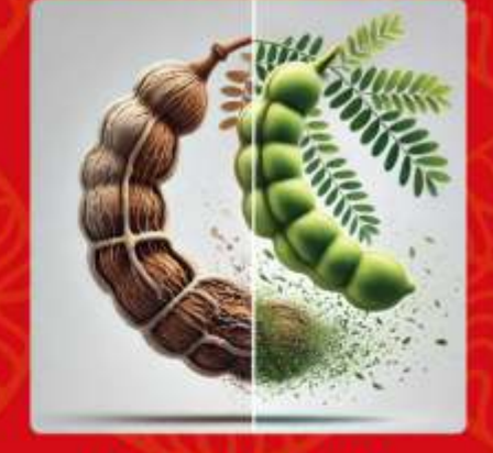
Old tamarind & New tamarind