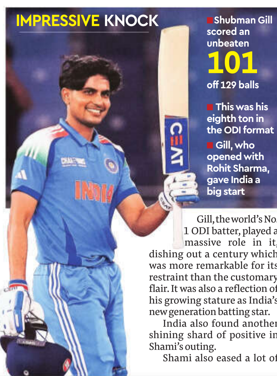
IMPRESSIVE KNOCK Shubman Gill scored an unbeaten 101 off 129 balls This was his eighth ton in the ODI format Gill, who opened with Rohit Sharma, gave India a big start

But India negated various pressure points, including a sluggish surface, during their chase effectively through Gill’s knock full of substance, and ended up at 231 for four in 46.3 overs. It’s also a nerve-settling victory for India ahead of their much-awaited clash against a more accomplished Pakistan at the same venue on February 23.