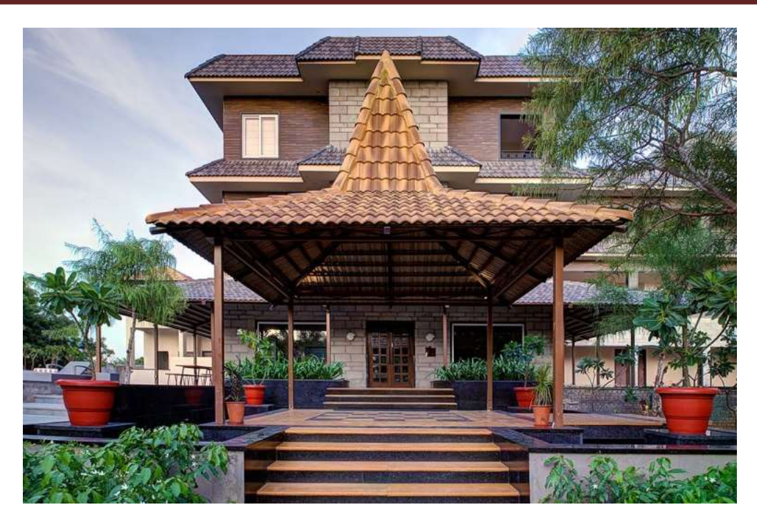
Samskara Resort, Jaipur