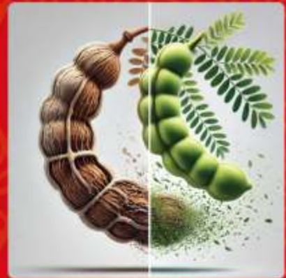
Old tamarind & New tamarind