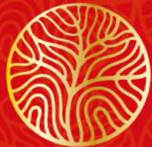
Roots to rise

The Bambino - Roots to Rise concept is born out of the understanding that the company, like the Bamboo Plant, has spent years growing roots into the soil of our Mother Land India, establishing itself as an unparalleled market leader and fostering relationships that span over decades.