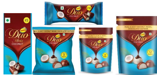
5. Chocolate Confectionery (Rs.15,000 crore)