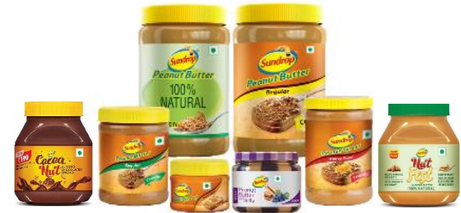
3. Spreads (Rs. 2300 crore)