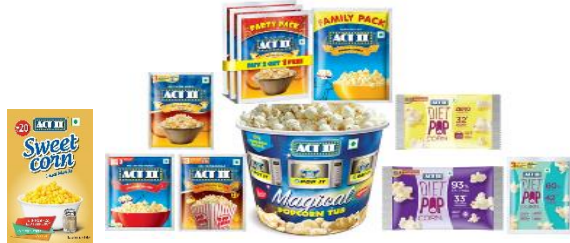
1. Ready to Cook Snacks (Rs. 10,000 crore)