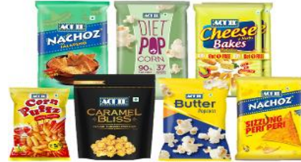
2. Ready to Eat Snacks (Rs. 35,000 crore)