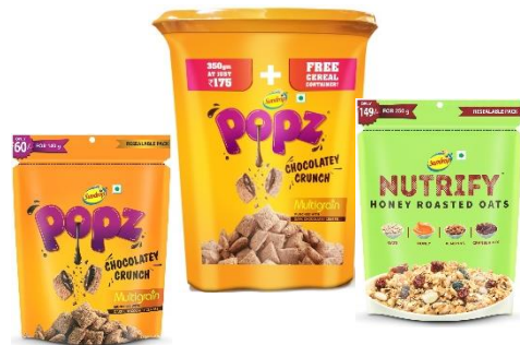
4. Breakfast Cereals (Rs. 2900 crore)