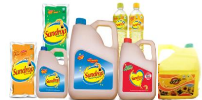
6. Edible Oils (Rs. 194,000 crore)