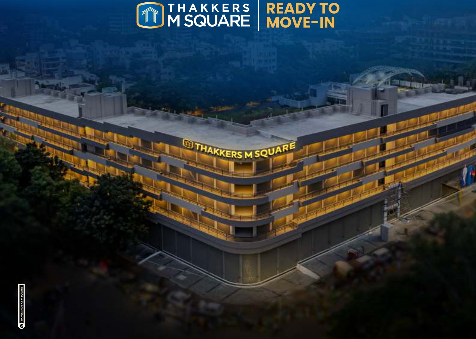
IMAGE SHOT AT M SQUARE

NEAR AAKASHWANI TOWER, GANGAPUR ROAD, NASHIK