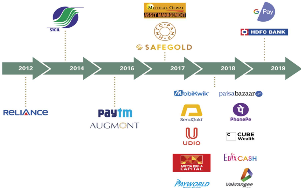
Figure 1: Timeline for launch of digital gold platforms in India