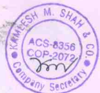
Name: Prachi Shah