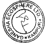
Statement Showing Shareholding Pattern

Quarter ended: 30.09.2015 Scrip Code BSE 514367 NSE GANECO5