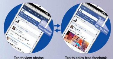
Tap to view photos

Log on to www.facebook.com . Tap on 'Go to Free' button for posts and comments, without any data pack. Tap on 'View Photos' button to see photos and videos with normal data charges. Stay connected to your family and friends all the time!