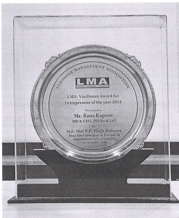
Mr. Rana Kapoor, MD & CEO, YES BANK and Chairman, YES Institute conferred 'Vardhman Award for Entrepreneur of the year 2015' by Shri V.P. Singh Badnore, Hon'ble Governor of Punjab

Ludhiana, December 02, 2016: Mr. Rana Kapoor, MD & CEO, YES BANK and Chairman, YES Institute, was conferred the 'LMA - Vardhman Award for Entrepreneur of the Year 2015' by Ludhiana Management Association during their Annual Day event.