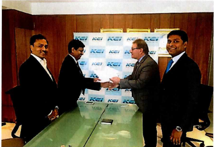
Photographs of Signing of Technical Collaboration Agreement