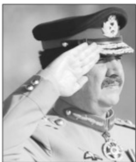
Day' in Rawalpindi.

Describing Kashmir as Pakistan's "lifeline", he said the true solution to the Kashmir issue lies not in "raining bullets" upon people in the Valley but in "heeding" to their voices and respecting their aspirations. "Kashmir issue can only be resolved by implementing the UN Resolutions," he said during a ceremony marking 'Defence