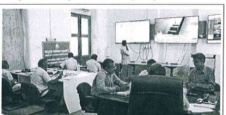
As part of monsoon preparedness, a 24/7 emergency call centre has been set up at the Ripon Buildings in Chennai today. As many as 75 officials have been deployed to take charge of the control room.

NT Bureau Chennai, Oct 27: As against the forecast that the northeast monsoon will begin by the end of this month, the Met department today said the seasonal rain will start within 24 hours. The department said the rain will be very intense this time with many places receiving above normal showers. An official from the Meteorological Department said, 'Conditions continue to remain favourable for commencement of northeast monsoon rain across Tamilnadu in the next 24 hours. Also, a cyclonic circulation is persisting over southeast Tamilnadu and neighbourhood while a trough is also extending over southeast Bay of Bengal.' 'Heavy rain is likely to occur at isolated places over Tamilnadu and Puducherry tomorrow and on Monday. In the last 24 hours, Vailparai recorded a maximum rainfall of 4.06 cm followed by Madurai and Palayamkottai which recorded 2.2 and 2.1 cm each. Coonoor recorded 1.2 cm,' he added. 'In Chennai, maximum and minimum temperatures were 32.1 and 24 degrees Celsius. Relative humidity was quite high at 87 per cent with traces of rainfall. In the next 24 hours, sky condition is likely to be generally cloudy. Rain or thundershowers is likely to occur at some areas,' he said about the city's weather.