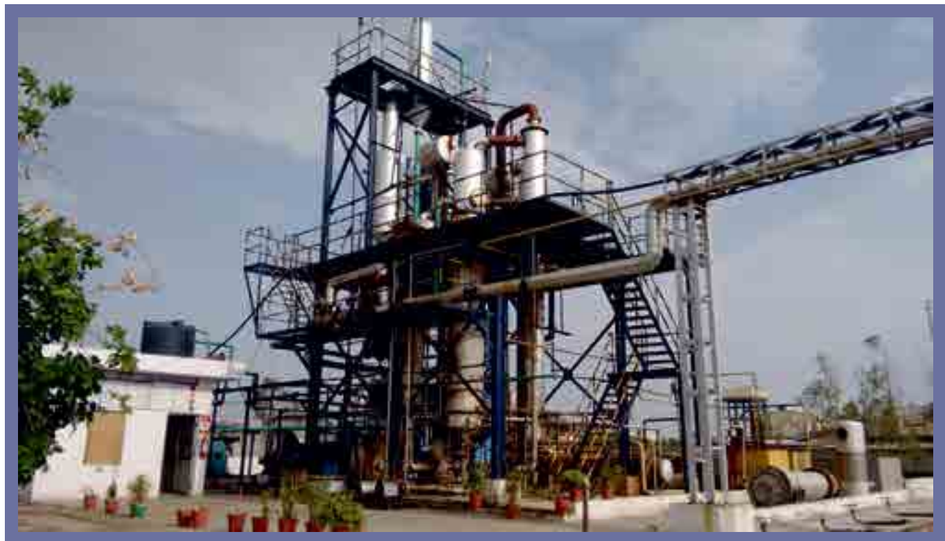
Zero Liquid Discharge Plant installed at processing division site at Mandpam, Bhilwara