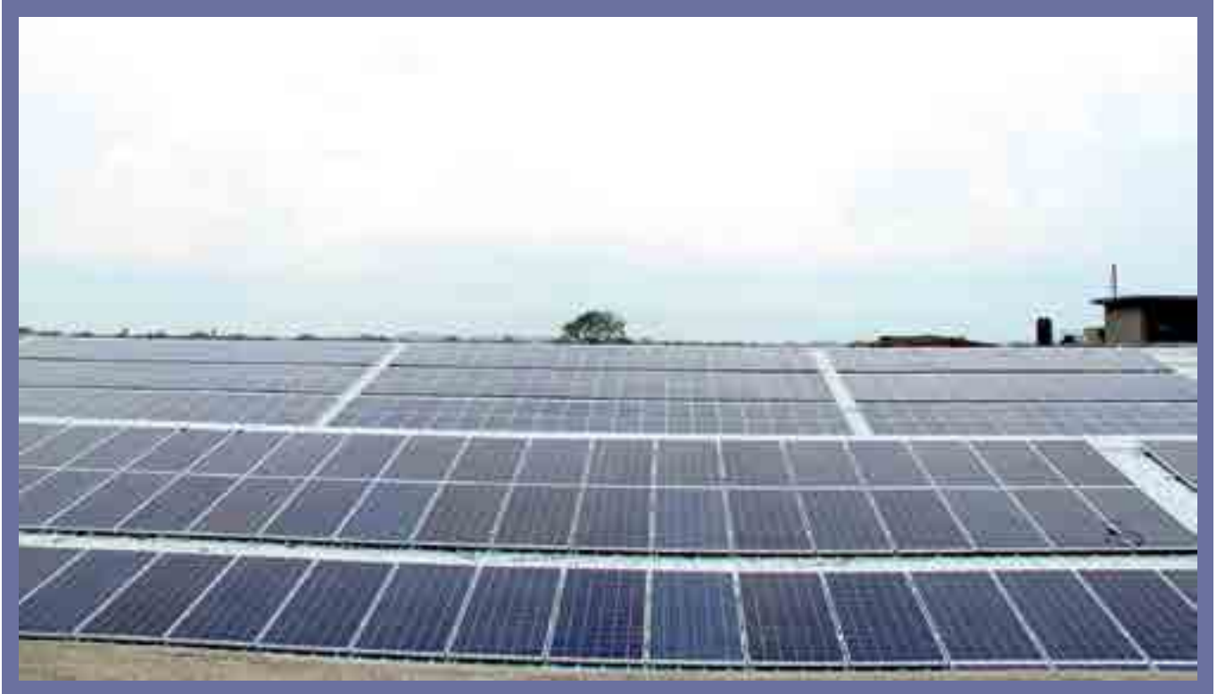
2.5 MW Roof-top Solar Power Generation Project installed at existing site Mandpam, Bhilwara